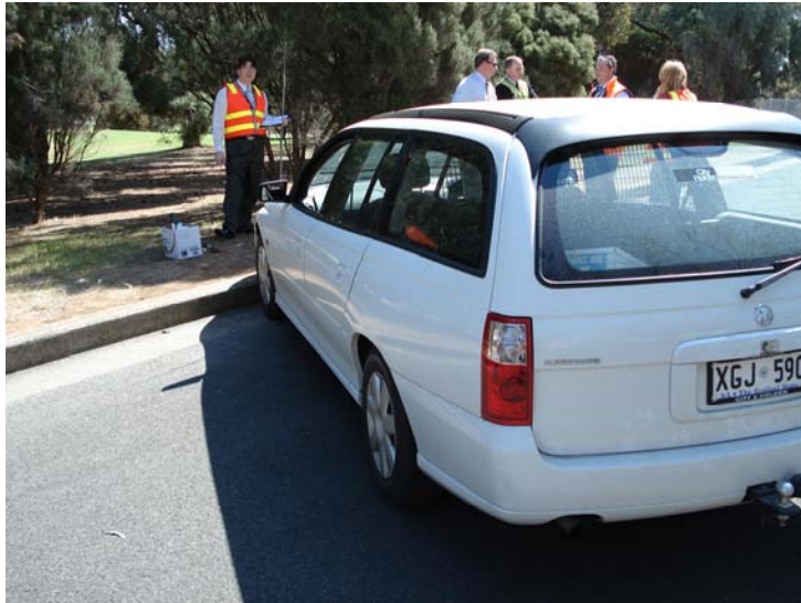
Angle parking position Commodore