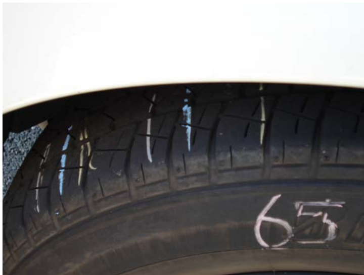
Left side tyre: white chalk, blue chalk, yellow chalk put on with extended chalk holder