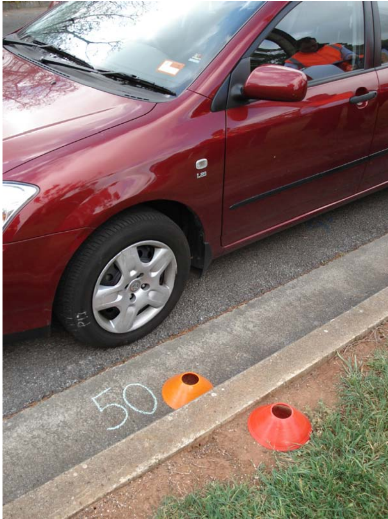
50 meter mark on street