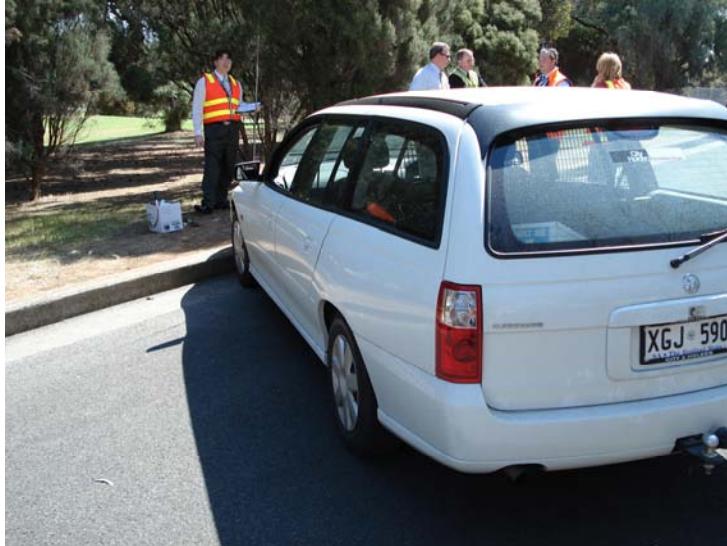
Angle parking position Commodore