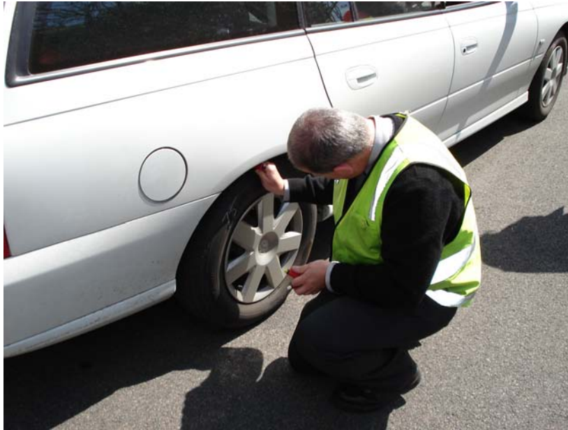
Use of short chalk holder