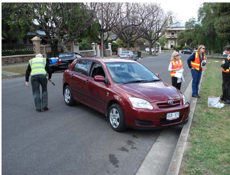
Angle parking position Corolla