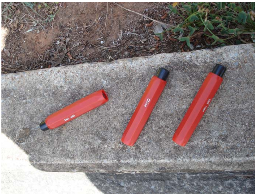
Short chalk holder