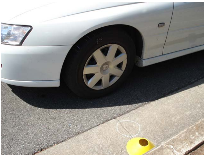
0 meter mark on street