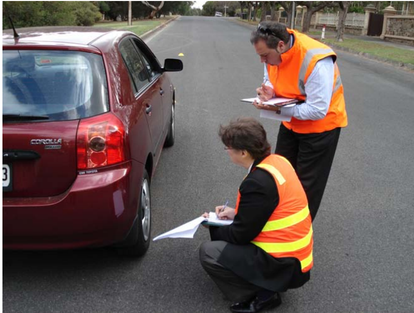
Assessors checking chalk marks