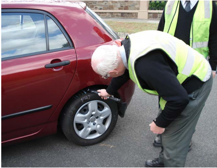
Use of Extended chalk holder